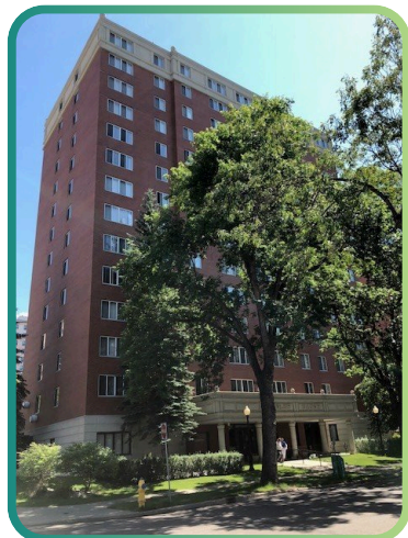
Teglar Manor located 9943 - 110 Street

This growth in the number of properties owned and/or operated by GEF is aligned with our Strategic Plan and our Mission of providing affordable, well-maintained, and secure buildings, where our clients can live with dignity and thrive in their communities with the support of friendly and caring staff and volunteers.