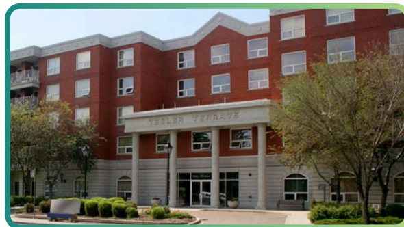
Teglar Terrace located 9918 - 149 Street

We are pleased to share that on July 1 st , GEF Seniors Housing officially acquired two new properties – Teglar Manor and Teglar Terrace! With this purchase GEF will grow to 43 Buildings with 3,964 Units.